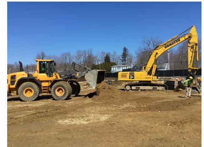
The new elementary school in Templeton, Massachusetts. Our operators working with the footing crews.