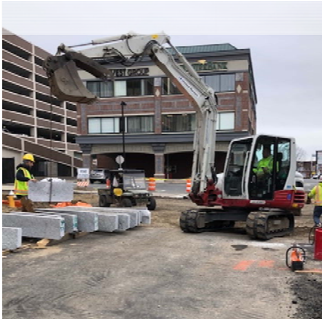
Will Roberts at MGM for Northeast Contractors setting curb for final landscape package.