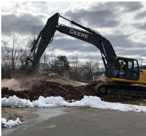
Bob Sieruta, working for Gerber Construction, is ripping rock for new soccer field in Springfield, Massachusetts.

The larger projects in the area have been completed or are winding down but there still will be a lot of activity in the area. Downtown Springfield will be busy due to the MGM streetscape projects, sidewalks and curbing along with repaving should keep our members busy. Pipe and road projects have been bid or are being released around the area. Business as usual for western Massachusetts.